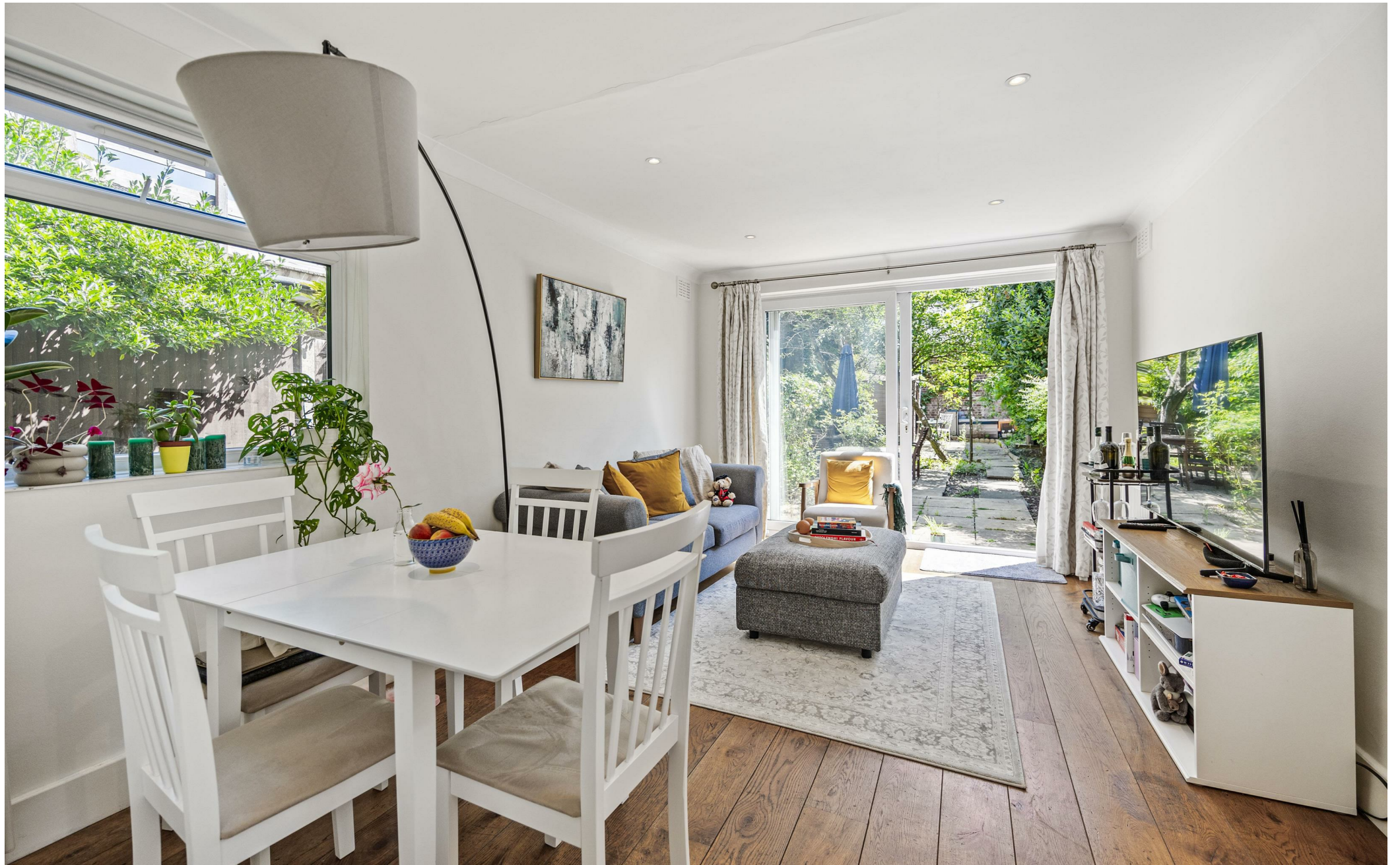
Goldhurst Terrace NW6